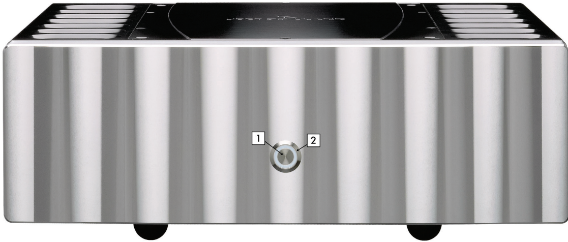
Figure 1: Front Panel